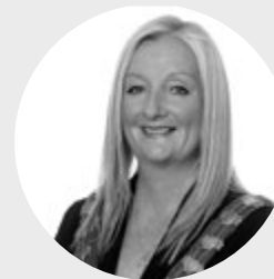
Mayor Tracey Roberts City of Wanneroo